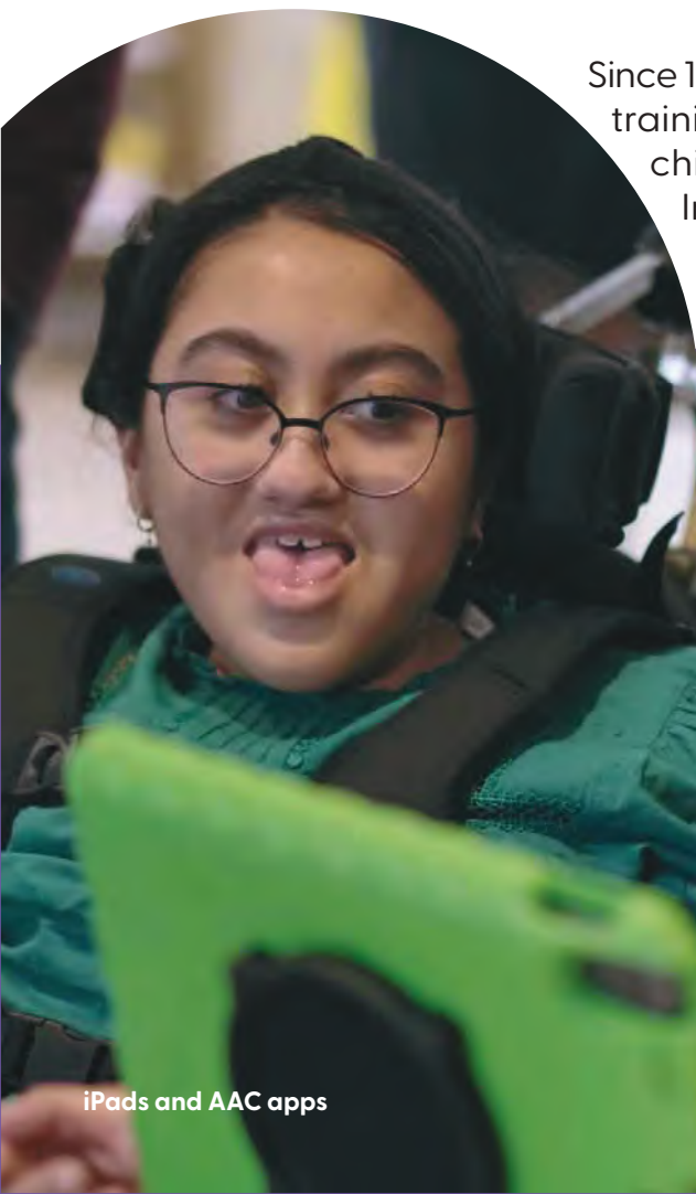
iPads and AAC apps

You can meet some of the children and families we support by visiting our website