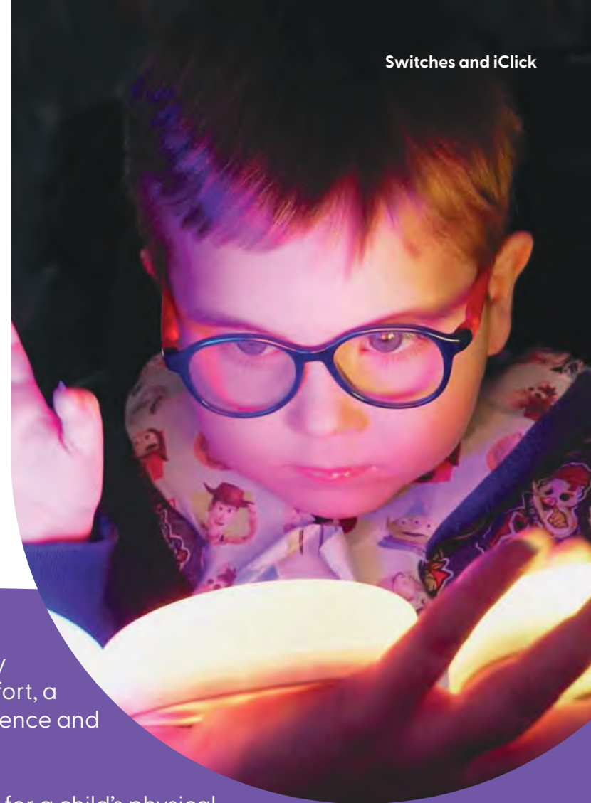
Switches and iClick