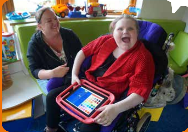
Bluetooth speaker. The total cost of all this is £692.

Our iPad package includes the iPad itself, the case, the apps, a charging station and some special mice, which give the user an extra level of control. We also provide a flexible mount to attach the iPad to a wheelchair and a waterproof